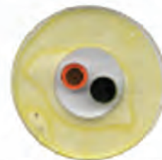
Trapping pit/lure cartridge